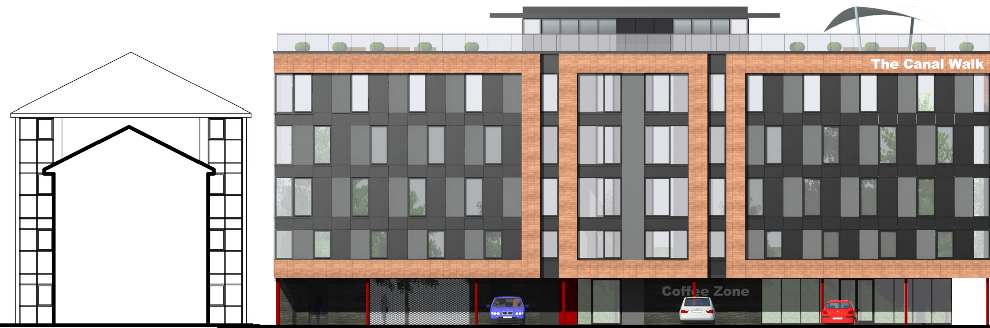
Front Elevation (from Drake Walk) 1:200 @ A3