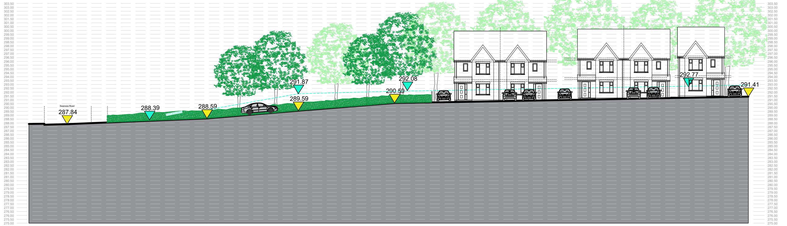
Section A-A 1:250 @ A3