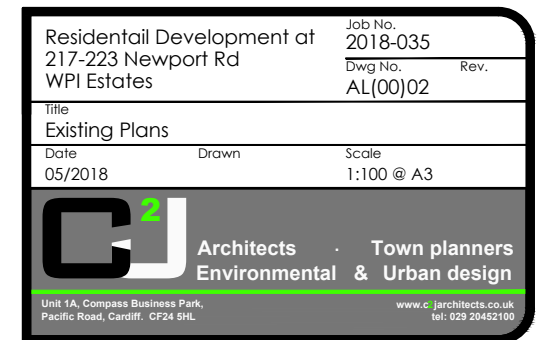
Existing Plans 1:100