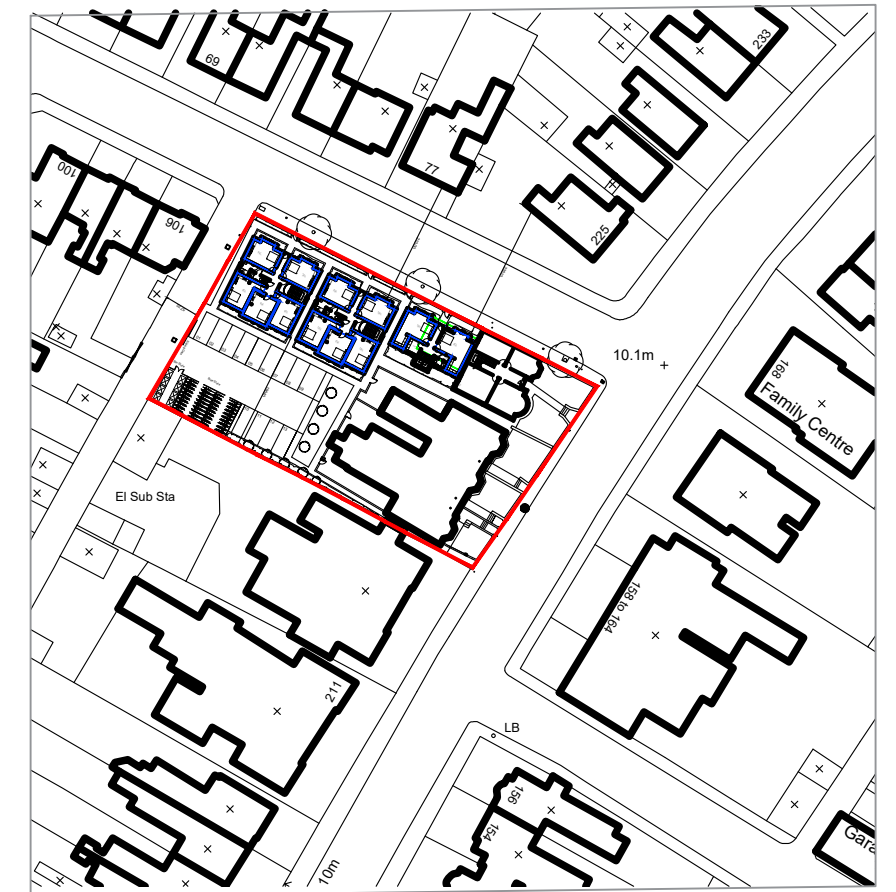
Site Plan 1:1250