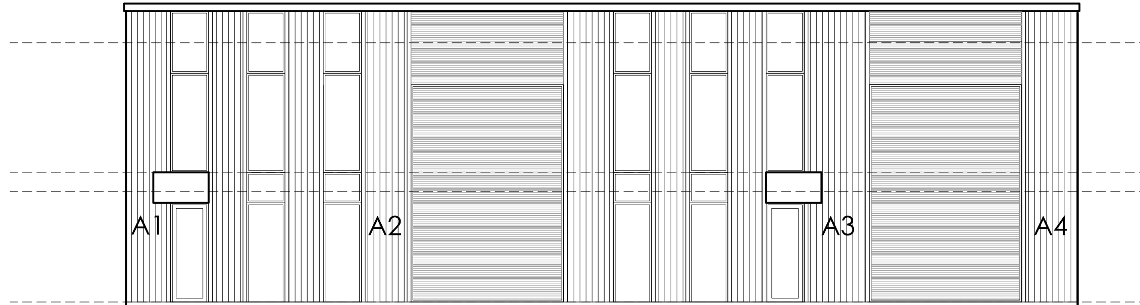
Block 'A' & 'D' Front Elevation