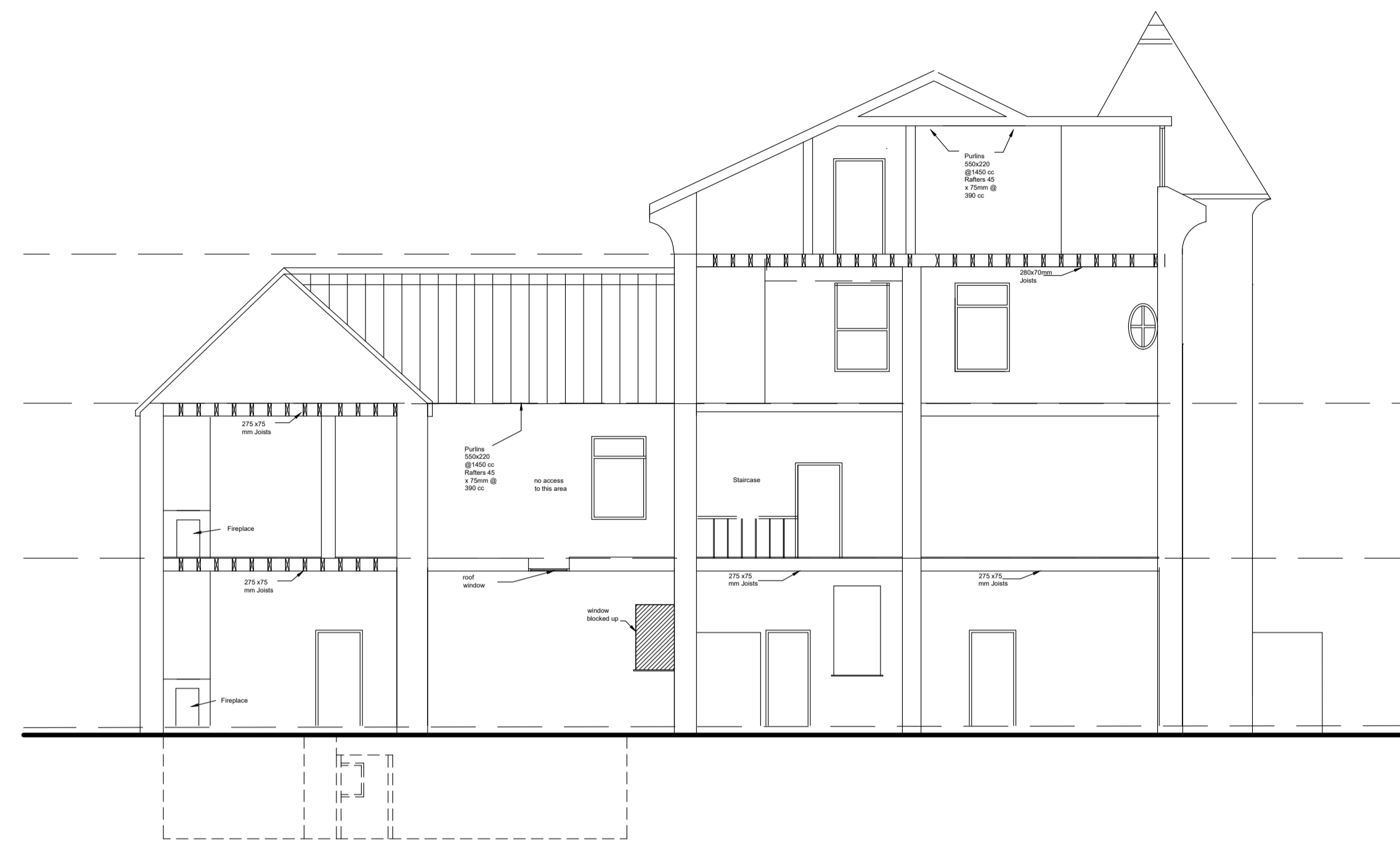
Section B-B 1:100 @ A1