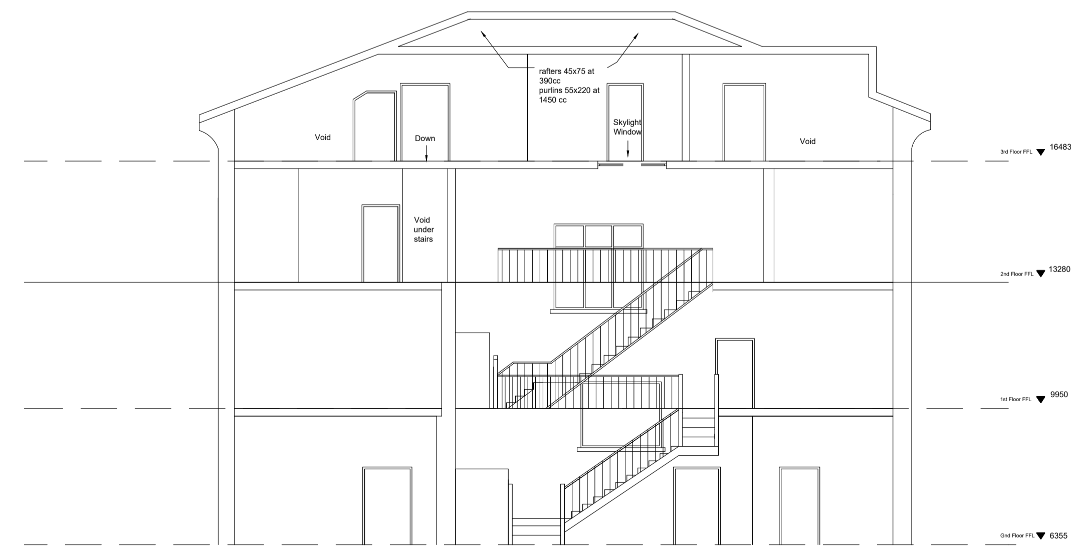
Section D-D 1:100 @ A1