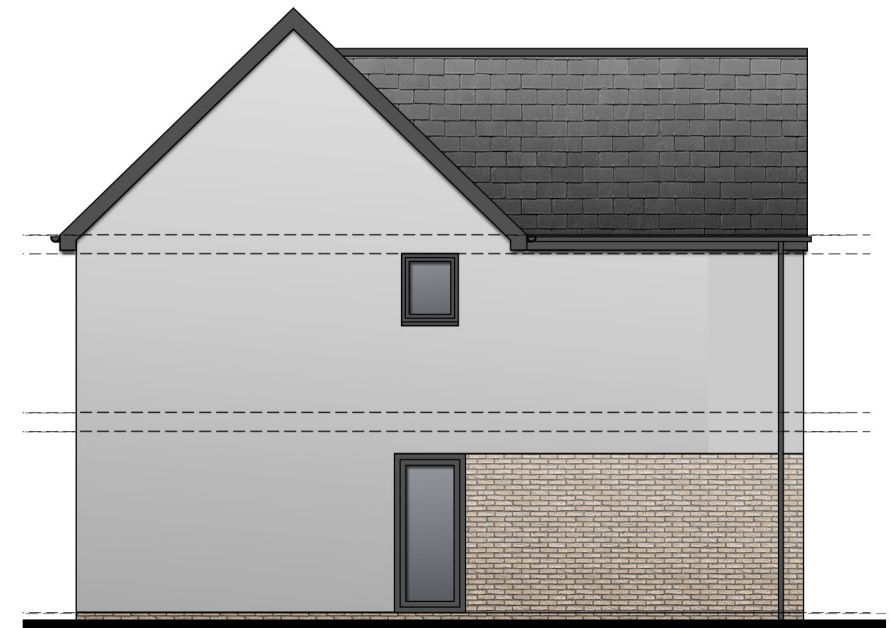
L/H Side Elevation 1:100 @ A3