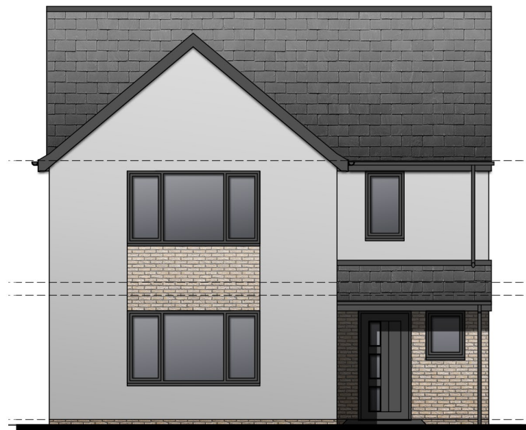
Front Elevation 1:100 @ A3