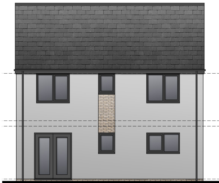
Rear Elevation 1:100 @ A3