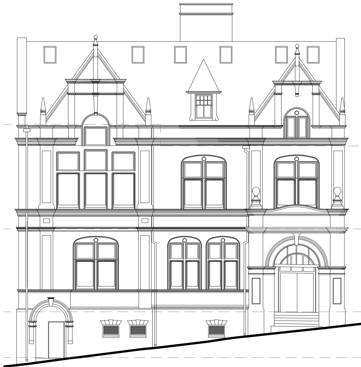
NORTH FACING ELEVATION @ 1:125