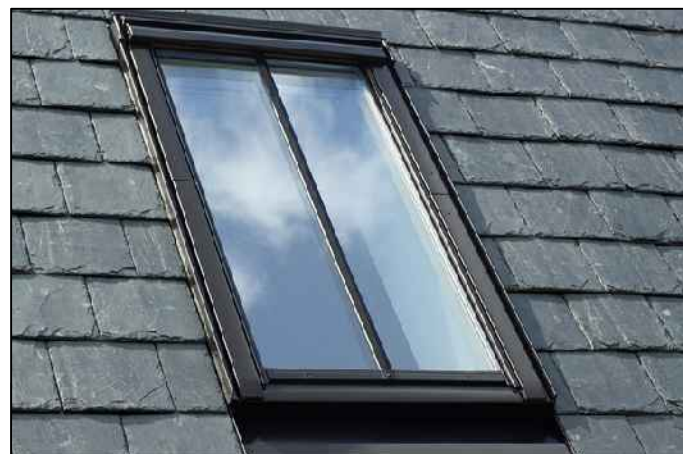
TYPICAL IMAGE OF CONSERVATION WINDOW TO ROOF, SIZE 660mm X 1180mm