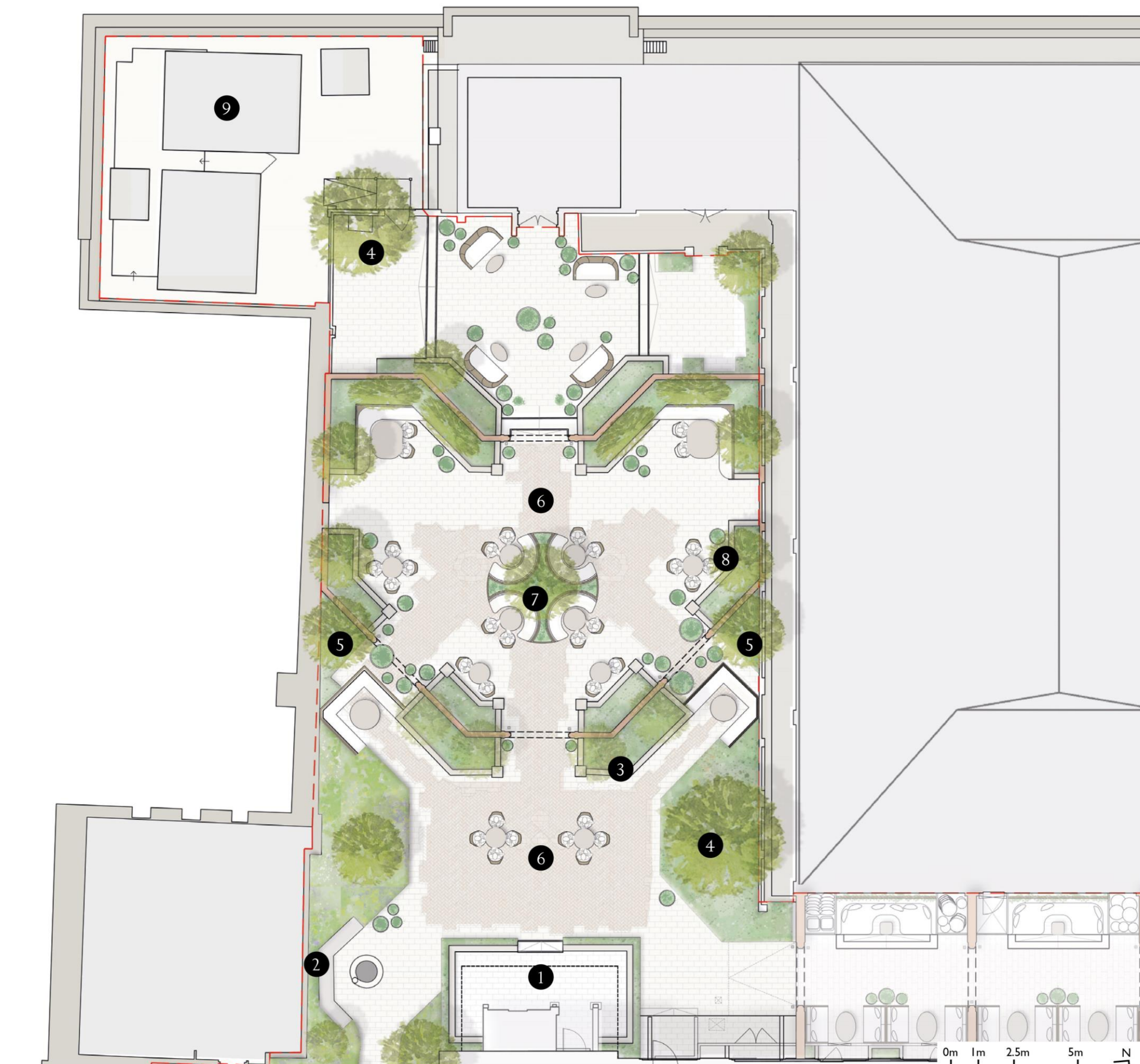
Spanish Garden Character Area (Approx. Scale 1:200)