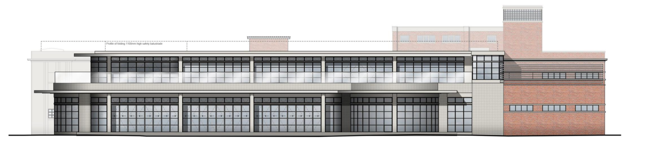
Elevation Facing South East