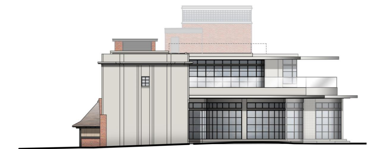
Elevation Facing South West