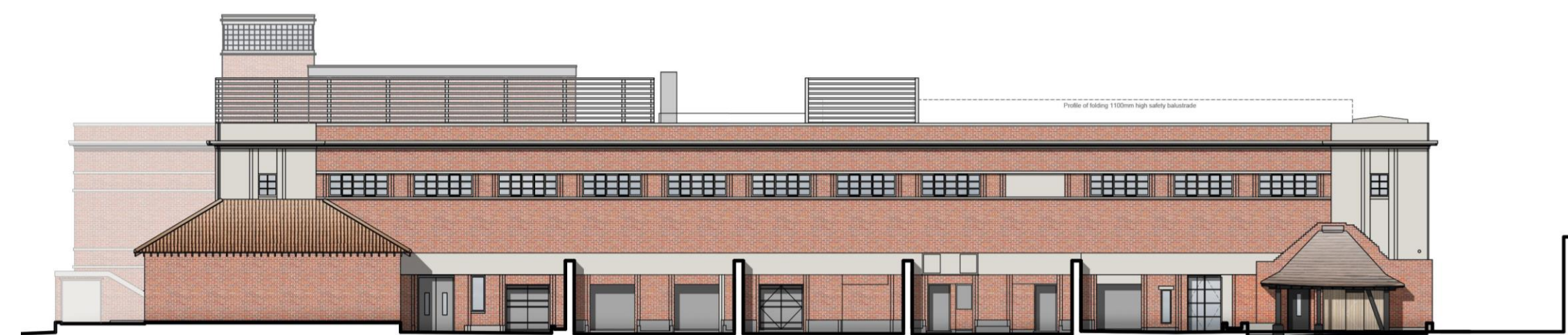
Elevation Facing North West