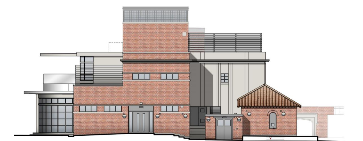
Elevation Facing North East