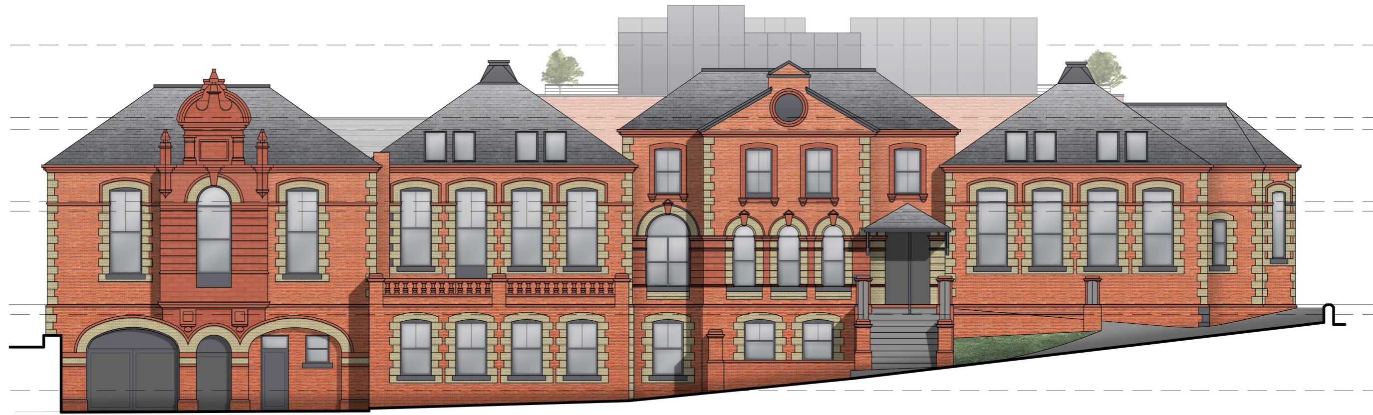
Front (South) Elevation